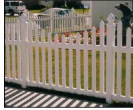
Danbury Scallop (sharp cap) Rothbury Scallop (dog ear cap)

Size: 7/8 x 3 Picket Space: 2.875 • Rails: Bottom 2x6 Middle 2x3.5 • Top 2x3.5 Height: 3'-4'-5' Colors: White & Sand