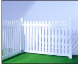
Danbury (sharp cap) Rothbury (dog ear cap)

Size: 7/8 x 3 Picket Space: 2.875 Rails: Bottom 2x6 • Top 2x3.5 Height: 3'-4'-5' Colors: White & Sand